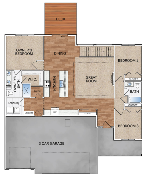
MAIN FLOOR 1,630 sqft